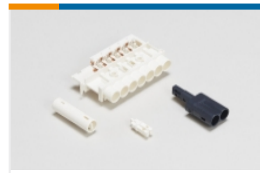
Plug &amp; Socket Lighting Connectors(54)